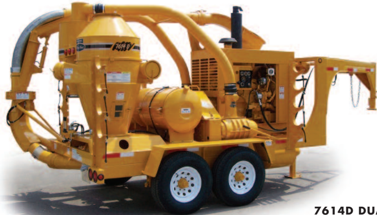
7614D DUAL BLOWER UNIT IN TRANSPORT MODE