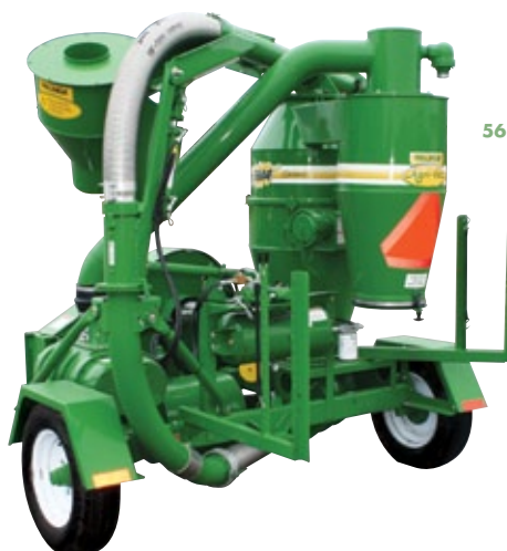
5614 DLX REAR VIEW

Due to continuous product development, specifications are subject to change without notice. Some items shown may be optional. *Capacities based on using 12' (3.65 m) suction line and truck loading kit. Capacity will vary with condition of product.