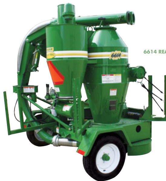
6614 REAR VIEW